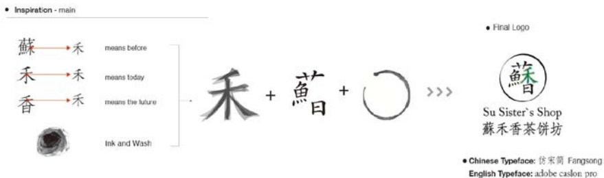
Fig. 2. The logo design of the store (author Liu Jiangxin, 2015)