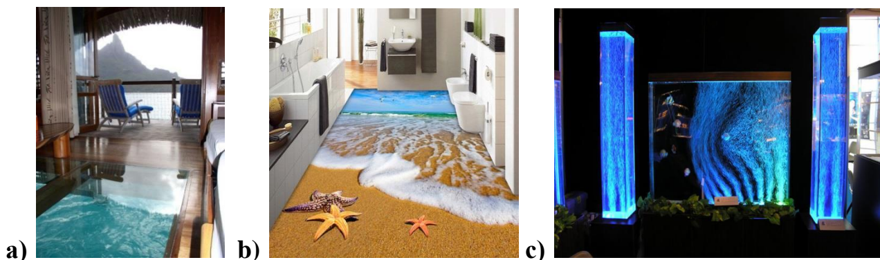
Fig. 1. a) glass floor; b) bulk coating; c) the use of fountains as a decorative element of the interior