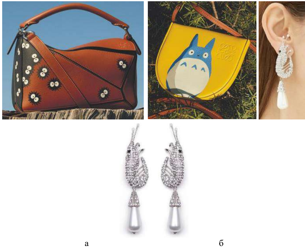
Fig. 1. Finishing accessories: a - bright prints on products of the Loewe brand; b - earrings in the form of large shrimp from the Shrimps brand

During quarantine social networks in particular TikTok began to play a significant role in creating trends. People have shown an interest to simple and bright clothes with unusual prints that are easy to remember. One such thing has gained widespread recognition - the indie brand dress Lirika Matoshi with transparent tulle and embroidery in the form of strawberries. Vogue magazine called her "the best dress of the summer" (Fig. 2, a). Such success of this dress became possible thanks to popularization through social networks: in a difficult period people wanted to feel children's joy, therefore bought things of such style. This dress in the style of the "Disney princess" achieved the greatest success.