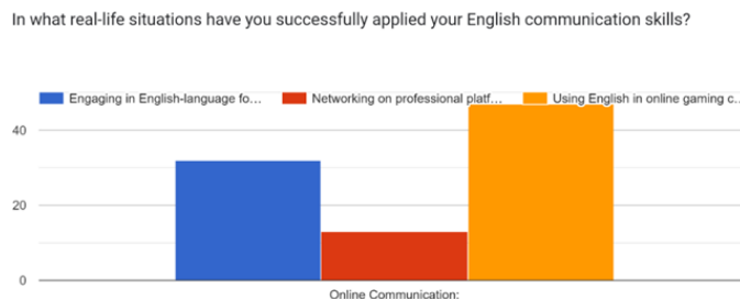
Figure 5 Application of English communication skills in online communication by online survey participants.

Participating in community activities, identified by 12 respondents, involves getting involved in local events, volunteer initiatives, or group activities aimed at benefiting the community. Effective communication in English enables individuals to collaborate with others, contribute ideas, and coordinate efforts toward common goals. Engaging in community activities in English fosters teamwork, promotes community engagement, and facilitates cross-cultural understanding, ultimately contributing to social cohesion and collective well-being within the community. Overall, the application of English communication skills in social settings enriches interpersonal relationships, fosters cultural exchange, and strengthens social bonds, enhancing individuals’ social experiences and promoting community involvement (Figure 5).