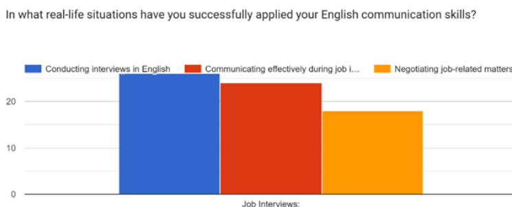
Figure 8 Application of English communication skills at job interviews by online survey participants.

Figure 8 illustrates the utilization of English communication skills during job interviews as reported by online survey participants. Conducting interviews in English, acknowledged by 26 respondents, involves individuals taking on the role of interviewer in English-language interviews, either as part of their professional responsibilities or during recruitment processes. Conducting interviews in English requires proficiency in the language to effectively assess candidates, ask pertinent questions, and evaluate responses to make informed decisions.