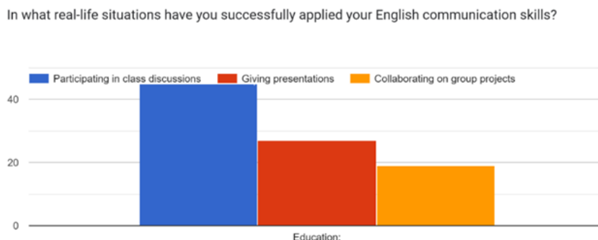
Figure 3 Application of English communication skills in education by online survey participants.

restaurant, reported by 30 participants, entails communicating food preferences, dietary restrictions, or meal orders to restaurant staff in English. This skill requires clarity, politeness, and the ability to convey preferences accurately to ensure a satisfying dining experience while traveling. Engaging in conversations with locals, as cited by 35 respondents, involves interacting with native speakers to learn about local culture, customs, or attractions or simply to socialize. Conversing in English enables travelers to connect with locals, exchange information, and gain insights into the destination, enriching their travel experiences. Overall, the application of English communication skills while traveling enhances communication effectiveness, fosters cultural exchange, and contributes to enjoyable and memorable travel experiences (Figure 3).