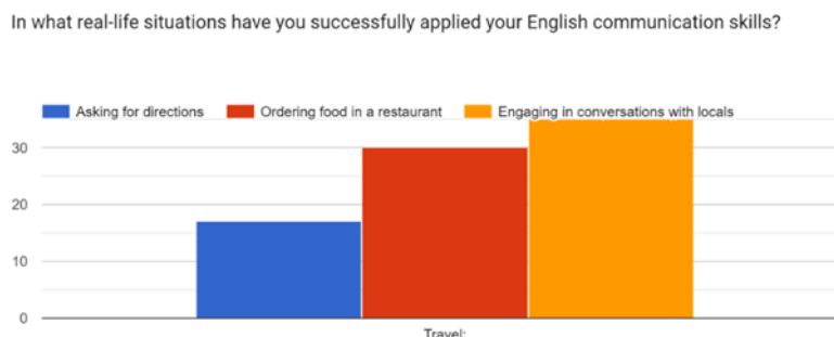
Figure 2 Applying online survey participants’ English communication skills while traveling.

English communication skills play a crucial role in various workplace scenarios, as evidenced by the survey responses. Presenting in meetings, a skill reported by 14 respondents, involves delivering information, proposals, or updates to a group of colleagues or stakeholders. Effective presentation skills require clarity, confidence, and the ability to engage the audience, all of which rely on proficient English language proficiency. Communicating with colleagues, reported by 45 participants, encompasses day-to-day interactions such as discussing projects, sharing ideas, seeking feedback, or resolving issues. These interactions contribute to a collaborative work environment and require clear and concise communication in English to ensure mutual understanding and productivity. Writing professional emails or reports, cited by 24 respondents, involves composing formal correspondence or documents for various purposes, including conveying information, making requests, or documenting processes. Strong written communication skills in English are essential for conveying professionalism, clarity, and accuracy in business correspondence, contributing to effective communication within and outside the organization. Overall, the application of English communication skills in the workplace facilitates effective collaboration, information exchange, and professional interactions, thereby contributing to organizational success (Figure 2).