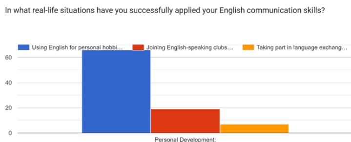
Figure 7 Application of English communication skills in personal development by online survey participants.

Figure 7 presents the various ways in which the online survey participants applied their English communication skills for personal development. Using English for personal hobbies or interests, as indicated by 66 respondents, involves incorporating English into activities such as reading books, watching movies, playing video games, or pursuing other leisure interests. Engaging in hobbies or interests in English allows individuals to enhance their language skills while indulging in activities they enjoy, thereby making language learning more enjoyable and rewarding.