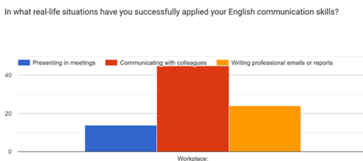
Figure 1 Application of English communication skills in the workplace by online survey participants.

English communication skills play a crucial role in various workplace scenarios, as evidenced by the survey responses. Presenting in meetings, a skill reported by 14 respondents, involves delivering information, proposals, or updates to a group of colleagues or stakeholders. Effective presentation skills require clarity, confidence, and the ability to engage the audience, all of which rely on proficient English language proficiency. Communicating with colleagues, reported by 45 participants, encompasses day-to-day interactions such as discussing projects, sharing ideas, seeking feedback, or resolving issues. These interactions contribute to a collaborative work environment and require clear and concise communication in English to ensure mutual understanding and productivity. Writing professional emails or reports, cited by 24 respondents, involves composing formal correspondence or documents for various purposes, including conveying information, making requests, or documenting processes. Strong written communication skills in English are essential for conveying professionalism, clarity, and accuracy in business correspondence, contributing to effective communication within and outside the organization. Overall, the application of English communication skills in the workplace facilitates effective collaboration, information exchange, and professional interactions, thereby contributing to organizational success (Figure 2).