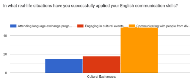
Figure 6 Application of English communication skills in cultural exchanges by online survey participants.

Figure 6 illustrates the diverse ways in which online survey participants apply their English communication skills in cultural exchanges. Attending language exchange programs, as reported by 16 respondents, involves participating in structured language learning activities or events where individuals gather to practice speaking English and other languages. Engaging in language exchange programs provides participants with opportunities to enhance their language proficiency, improve pronunciation, and gain cultural insights through interactions with native speakers and language learners from diverse linguistic backgrounds.