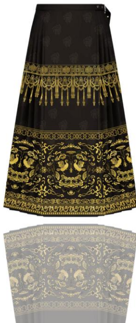
Fig. 2. Samples of modern digitized textiles