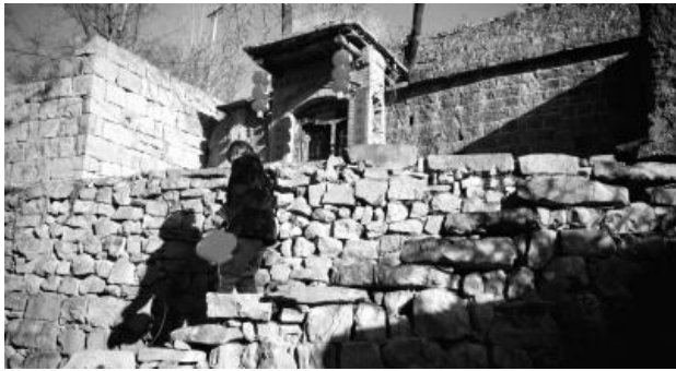
Fig. 1. Xiuwu County Xicun Township before renovation