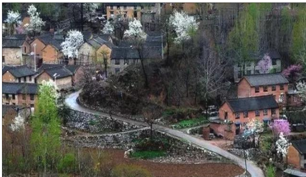
Fig. 3. Streetscape of Xiuwu County's West Village