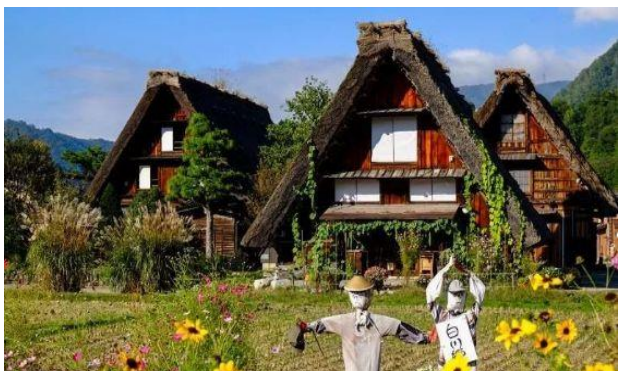
Fig. 7. Shirakawa-go Hapo Village, Japan Village