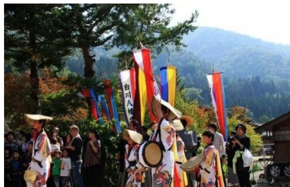
Fig. 8. Japan's Village masquerade