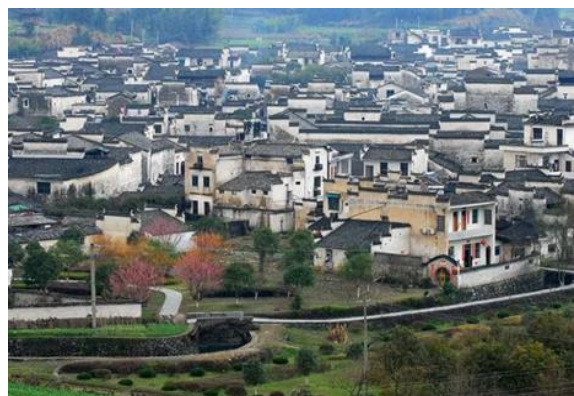
Fig. 6. Rural environment of Hongcun, Anhui, China