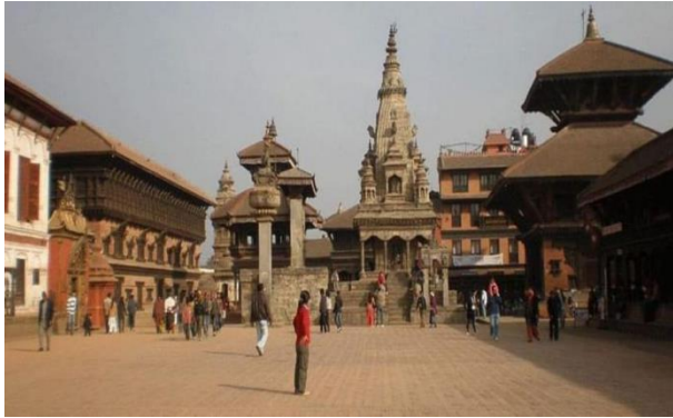
Fig. 9. Durbar Square, Bhaktapur, Nepal