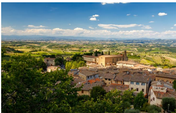
Fig. 5. uscan countryside setting, Italy