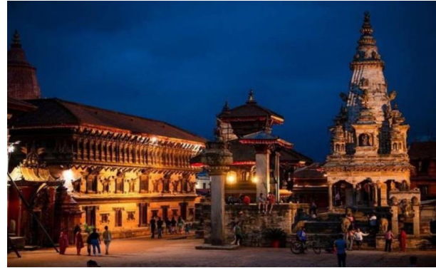
Fig. 10. Night view of Durbar Square, Bhaktapur, Nepal

1. Enhanced Aesthetic Experience: By integrating atmospheric aesthetics , traditional village designs can focus more on creating a cohesive overall atmosphere. This allows people to experience a unique artistic charm and emotional resonance within these spaces.