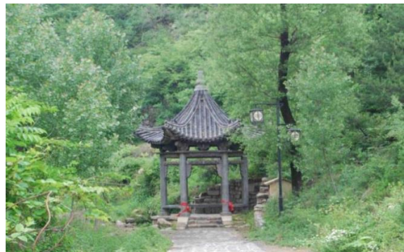
Fig. 4. Xiuwu County Xicun's Pavilion