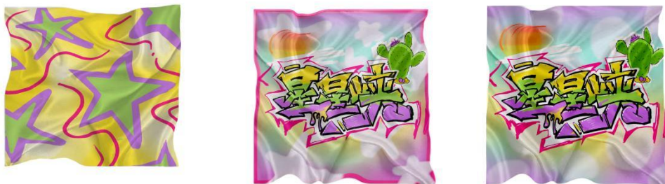
Figure3-17 Cultural and creative design