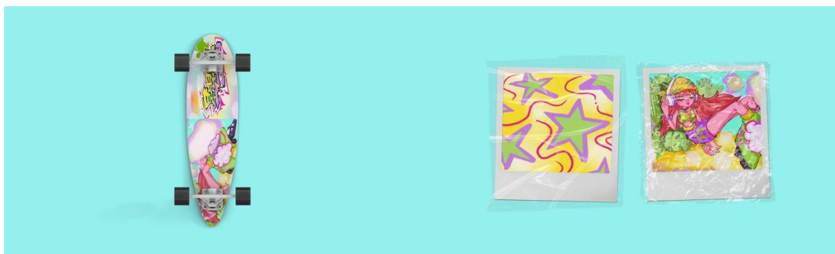
Figure3-14 Cultural and creative design