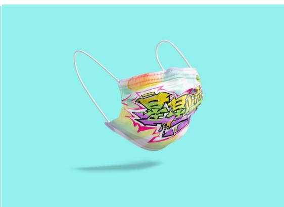
Figure3-13 creative design