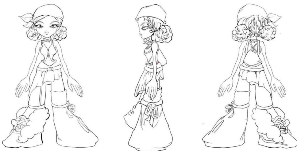
Figure 3-3 IP image three-view line draft