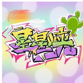
Figure 3-2, font finalization