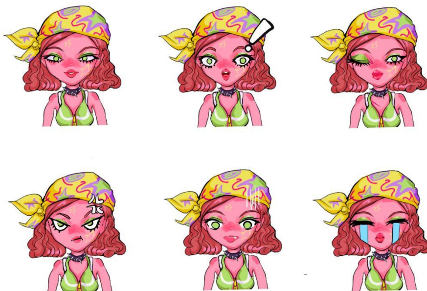
Figure 3-6 Final draft of IP image expression package