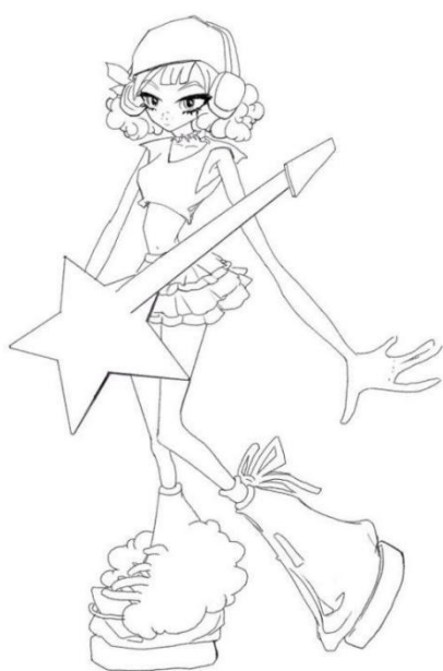
Figure 3-9 Design line drawing