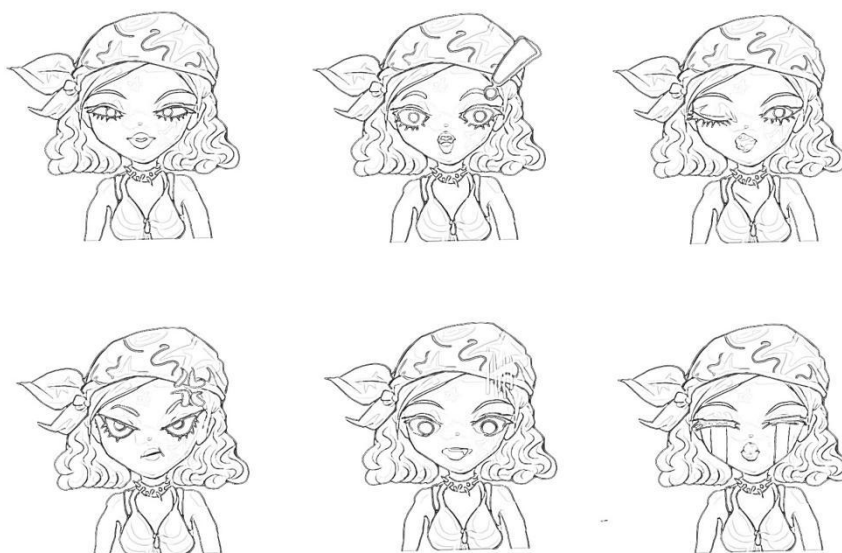
Figure 3-5 IP image emoji package line draft