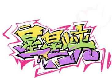
Figure 3-1, font finalization