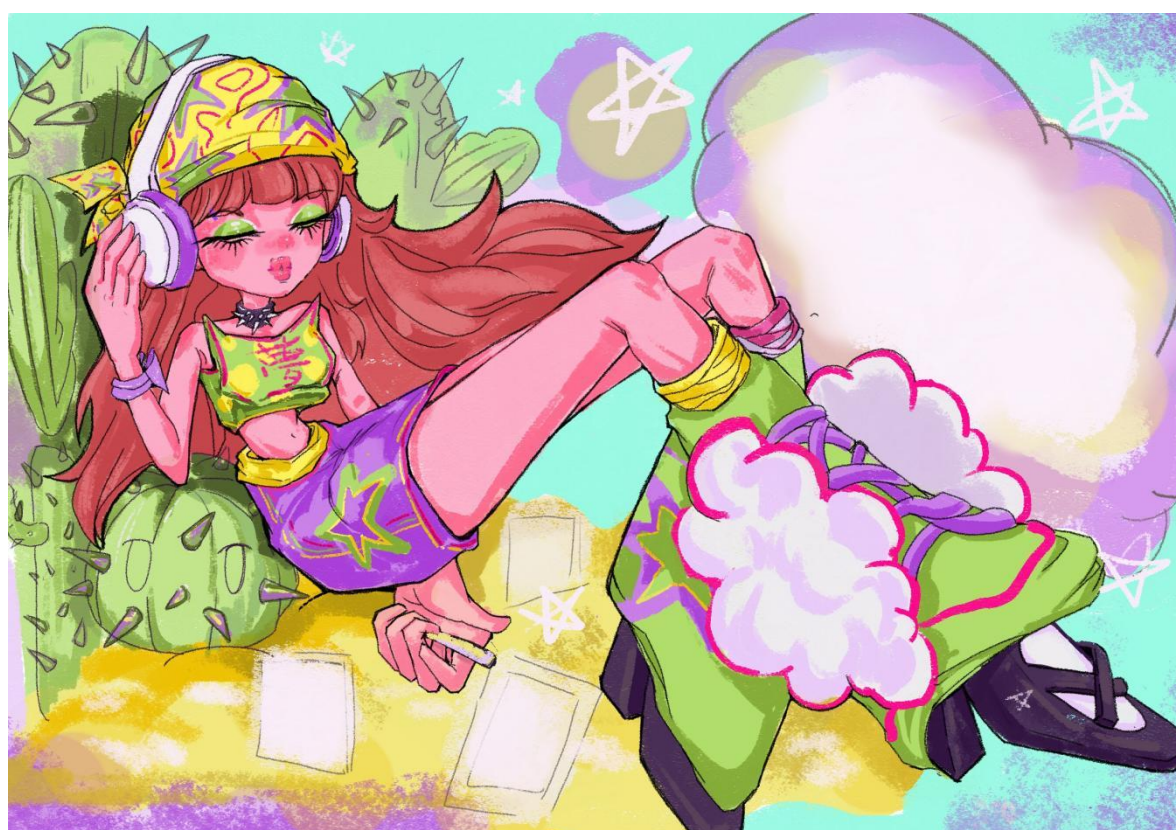
Figure 3-8. Final draft of the illustration design