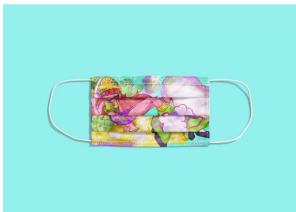
Figure3-11 Cultural and creative design