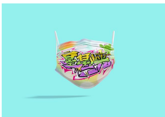
Figure3-12 Cultural and creative design