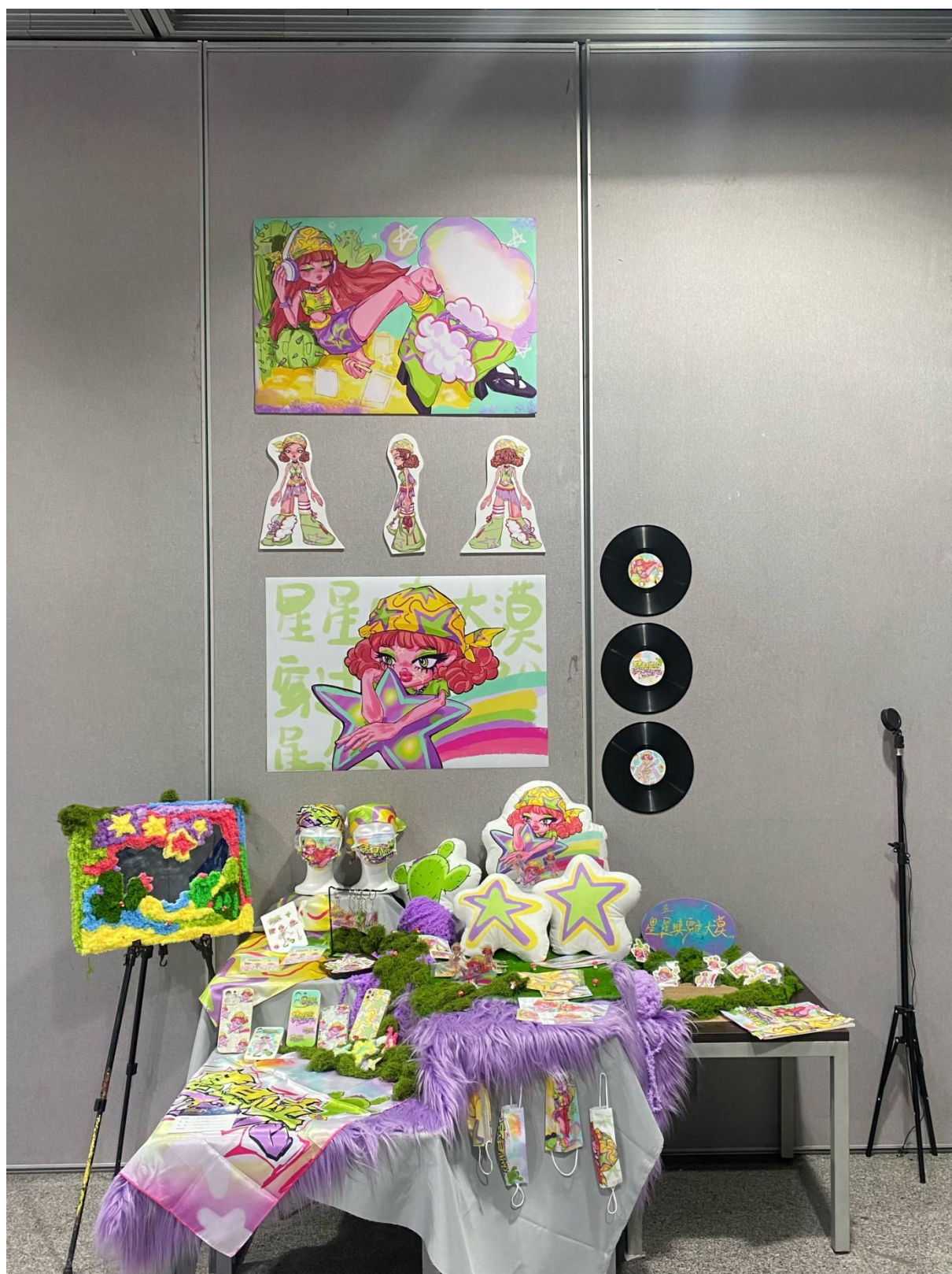
Figure3-18 Design the overall display