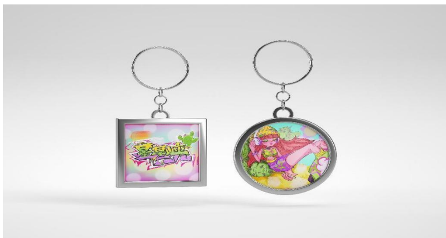
Figure3-16 Cultural and creative design