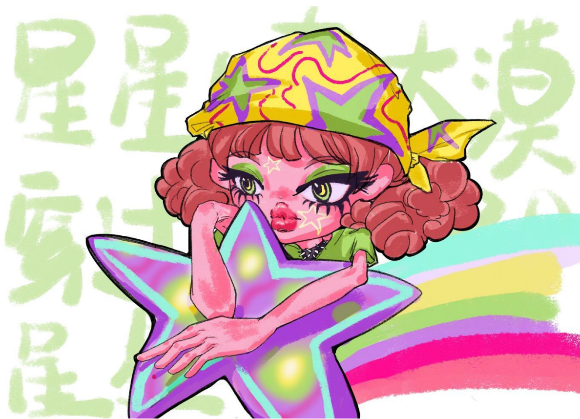
Figure 3-10 Final draft of the illustration design