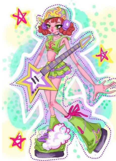
Figure 3-9 Final draft of the illustration design